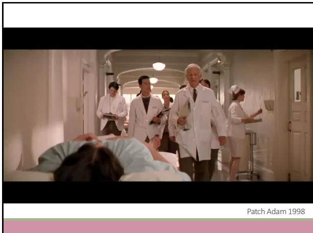
Patch Adams 1998